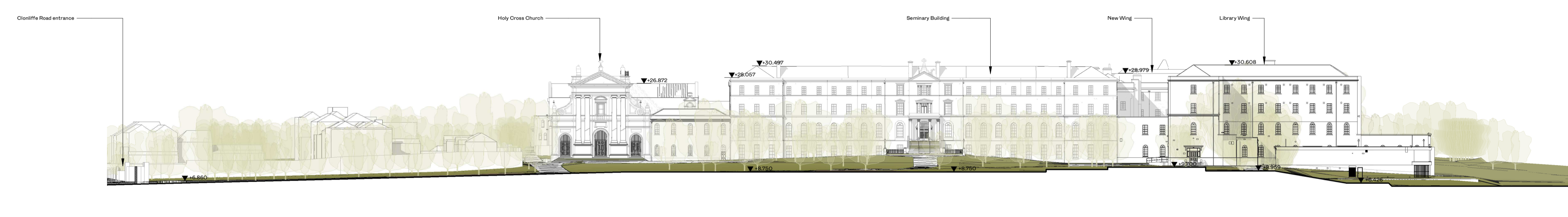
2 Section E-E - Formal Lawn Existing 1 : 500